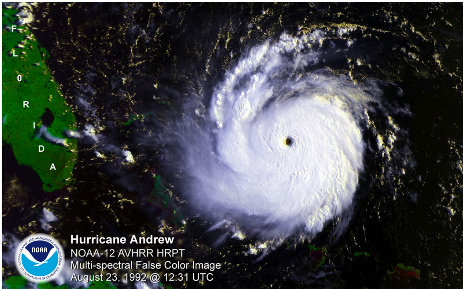
Hurricane Andrew NOAA-12 AVHRR HRPT Multi-spectral False Color Image August 23, 1992 @ 12:31 UTC